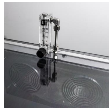
Figure 1 Thread in flowmeter as shown

Set the flowmeter to between 5 and 20 SCFH (depending on desiccator size and moisture requirements). Connect ¼" tubing from an externally regulated gas source (20-40 psi, depending on desiccator size) to flow meter inlet. Push tubing in for connection; to release, depress connector ring and pull tubing out. If flowmeter replacement is needed, order flowmeter kit (1600-32-ISO).