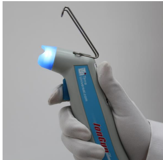
Figure 5: Nozzle LED lights glow when unit is operational