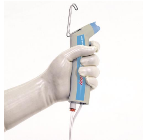
Figure 1: Cleanroom Ionizing Blow-Off Gun (Cat. # 2005-55)

All materials are chosen for cleanliness and durability. The titanium emitters can be replaced in a matter of minutes. Particle generation during operation is negligible as long as the gun is connected to a filtered gas source. It includes a 0.4 micron in-line filter and a power supply (120 or 220VAC).