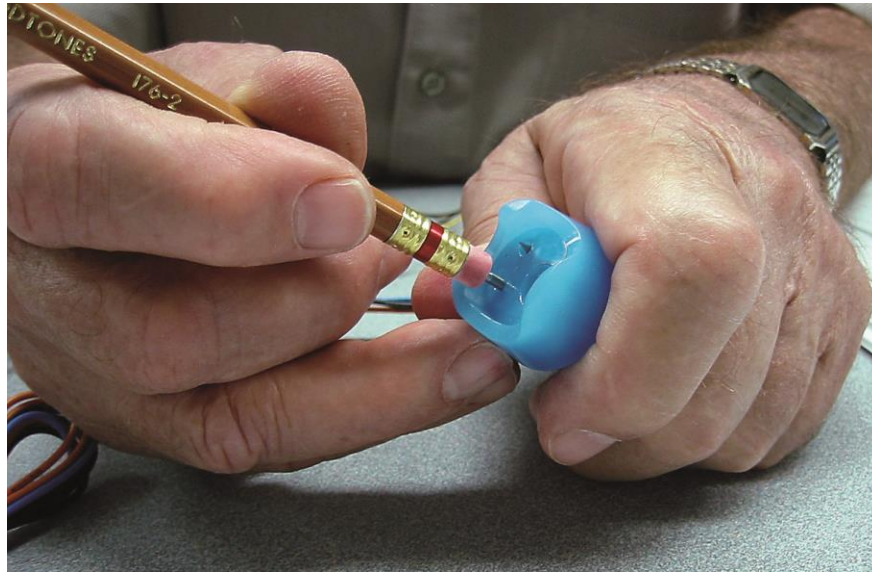
Figure 6: Use a pencil eraser to push the emitters out of the nozzle

If deposits cannot be removed, or if the tips appear worn or bent, the Ionizing Blow-Off Gun may not discharge surfaces with optimal efficiency. In this case, replace the tips, using either needle-nosed pliers or a pencil eraser. Tips can be removed and inserted simply by applying mild pressure; no twisting is necessary.