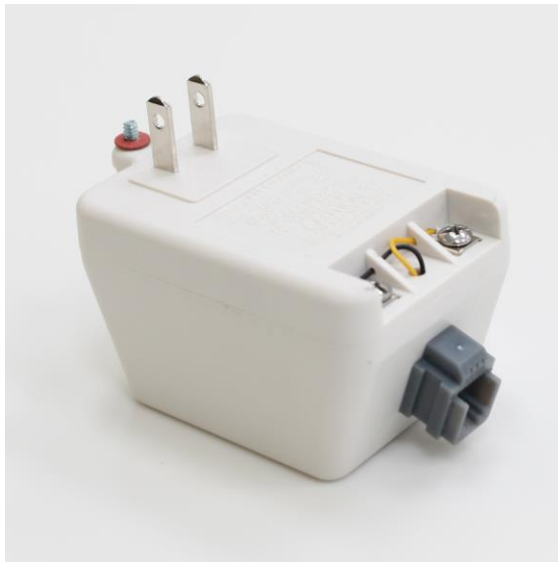
Figure 4: 120V power transformer with low-voltage phone cable connection on the bottom