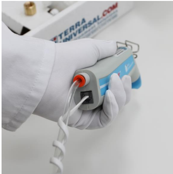
Figure 2: Gas and power connections at the base of the ionizing gun