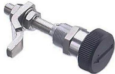
Pawl and Latch Assembly

The filter(s) are held securely in place by two plated-steel pawls along the front edge of the filter housing. Rotate each black knob 90° to release the filter(s) and then carefully lower them out of the housing. Insert the replacement filter(s) and rotate the pawls back into position.