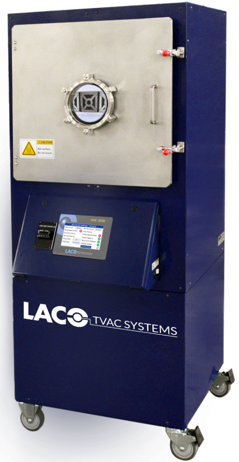
FSB-2020B Standard Bake-Out Test System

High volume test area with conductive thermal control platen accommodates products up to 6U in size.