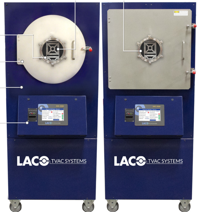
FSB-1824B Bake-Out System

Cube or cylindrical style stainless steel chamber with 6-inch glass viewport and internal LED lighting