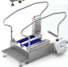
MBW Compact Design