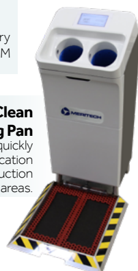
Sole Clean Sanitizing Pan Evaporates quickly post-application for dry production areas.