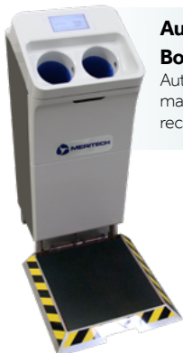
Automated Boot Dip Automatically maintains regulatory recommended PPM

Achieve more than 99% of pathogen removal from footwear during a 12-second CleanTech® hand wash