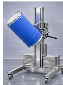
SIDE ROTATOR TILTER