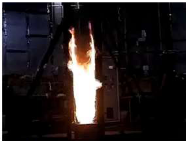
Non FM Plastics Sheet (Polypropylene)