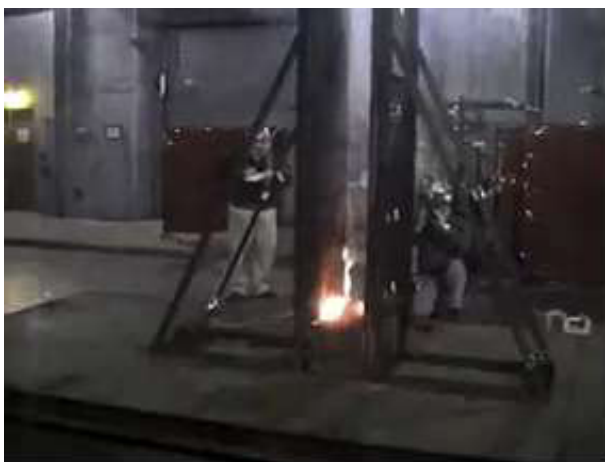
Takiron "IVY-ONE" (IVY573)