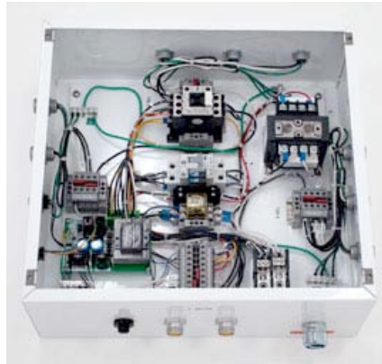
Power Distribution Module (PDM)

Terra's EnergySaver system does. This economical system interfaces with Terra's standard PDMs to allow variable control from a console mounted on the main cleanroom control panel, providing two key benefits: