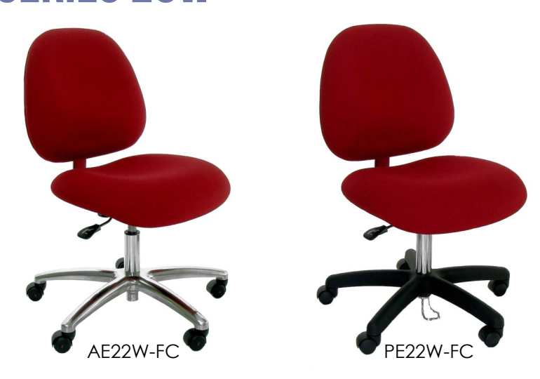
Super Heavy Duty 450 lbs, Capacity, Waterfall 3" High Resilient Density Foam for Better Comfort