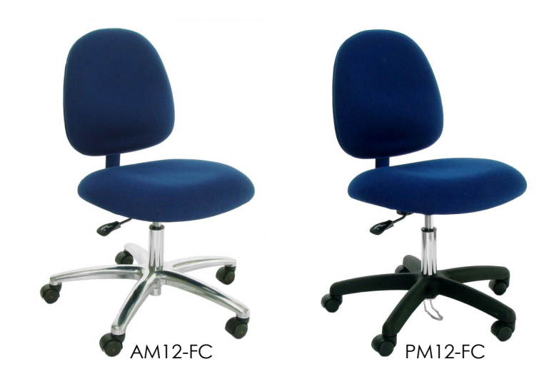
Super Heavy Duty 450 lbs, Capacity, Waterfall 3" High Resilient Density Foam for Better Comfort