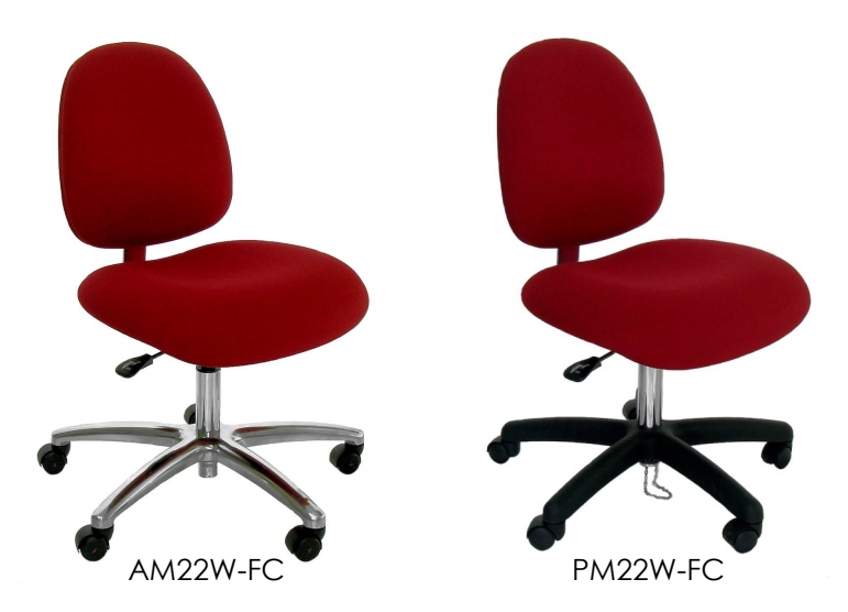
Super Heavy Duty 450 lbs, Capacity, Waterfall 3" High Resilient Density Foam for Better Comfort