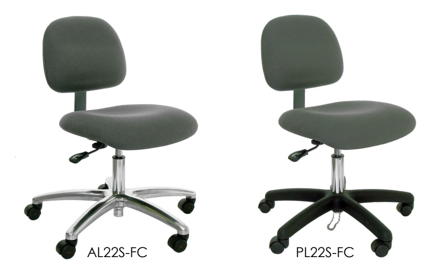
Super Heavy Duty 450 lbs, Capacity, Waterfall Front Contour Seat and 2.5" High Resilient Density Foam for Better Comfort