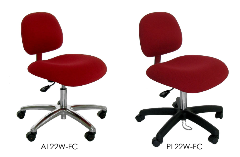
Super Heavy Duty 450 lbs, Capacity, Waterfall 3" High Resilient Density Foam for Better Comfort