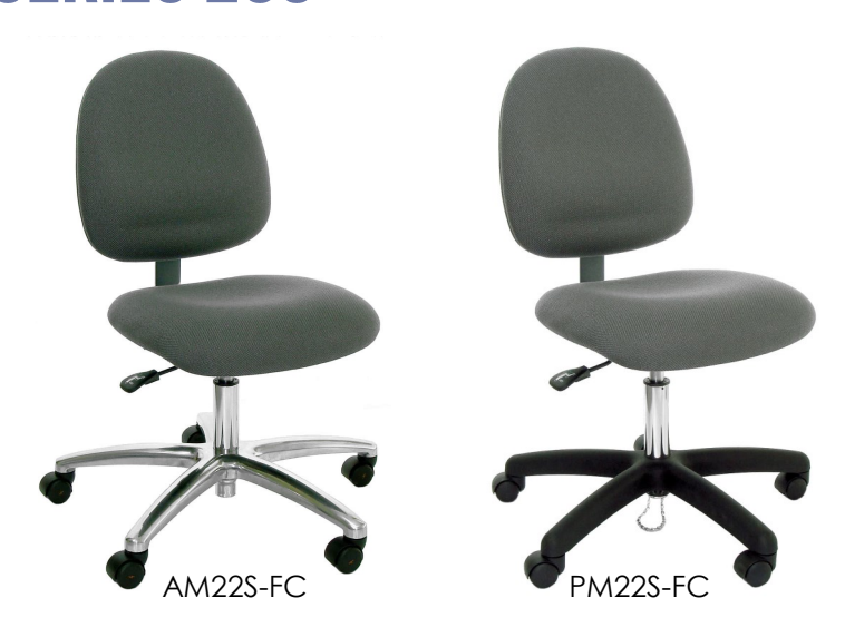
Super Heavy Duty 450 lbs, Capacity, Waterfall Front Contour Seat and 2.5" High Resilient Density Foam for Better Comfort