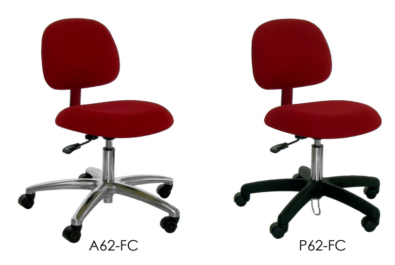
Super Heavy Duty 300 lbs, Capacity, 2.5" High Resilient Density Foam for Better Comfort