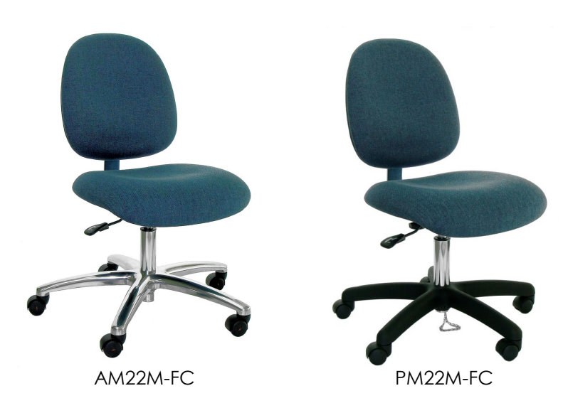
Super Heavy Duty 450 lbs, Capacity, Waterfall Front Contour Seat and 3" High Resilient Density Foam for Better Comfort.