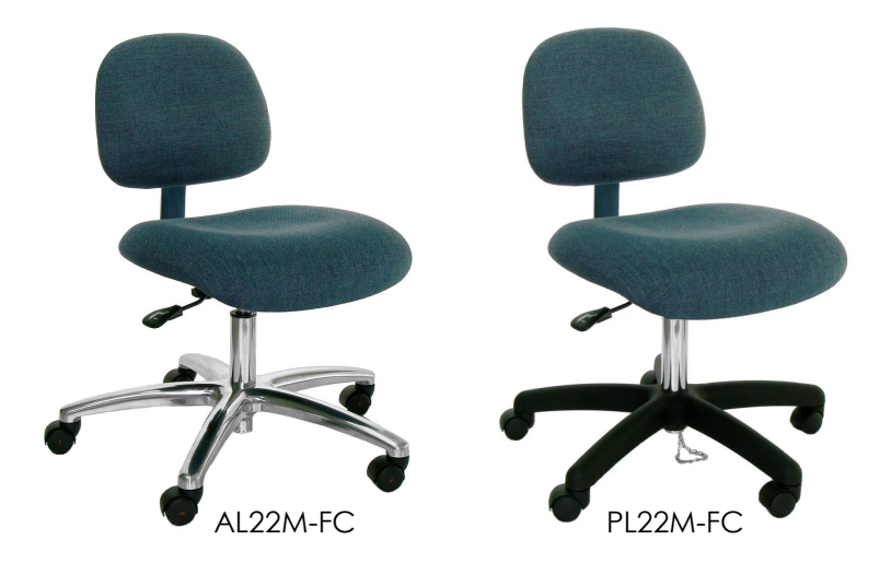
Super Heavy Duty 450 lbs, Capacity, Waterfall Front Contour Seat and 3" High Resilient Density Foam for Better Comfort.