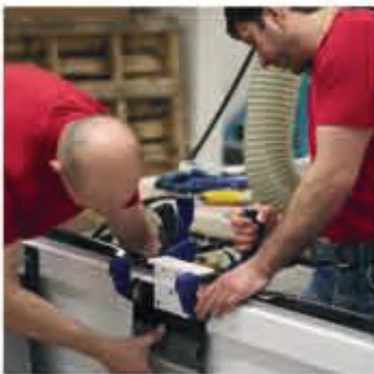
Installation & Commissioning