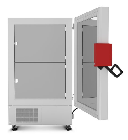
Model UF V 700