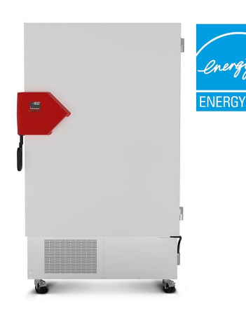
Model UF V 700