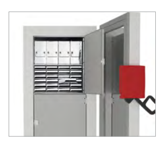
Foam-filled compartment doors with gasket