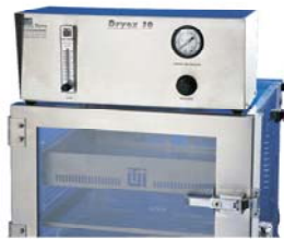
Dryer 80 Outlet Flow: 54-105 SCFH

Terra Universal's Dryex Gas Dryer is designed to provide reliable gas drying without the expense and inconvenience associated with desiccant drying systems. It uses efficient membrane separation technology to remove moisture and particulates from a stream of compressed air. By regulating the flow of air from the Dryex, you can determine the humidity of the air output (see the performance graph for typical system performance)