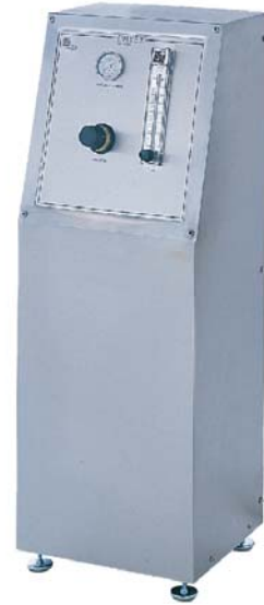
Dryer 80 Outlet Flow: 420-900 SCFH