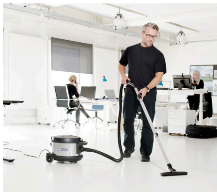
The GD 930 is the perfect choice for demanding applications such as offices, hotels and public buildings