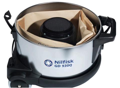
Durable steel container and 15 litre dust bag