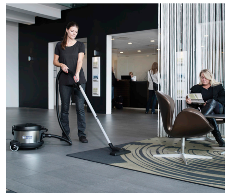
The new GD 930Q is specially built for noise sensitive areas with a low comforting background sound pressure level of only 42 dB(A)