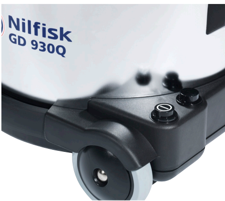
Dual speed function