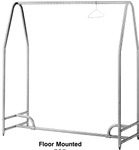
Floor Mounted FGR