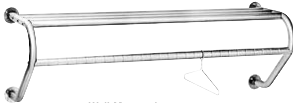
Wall Mounted WGR